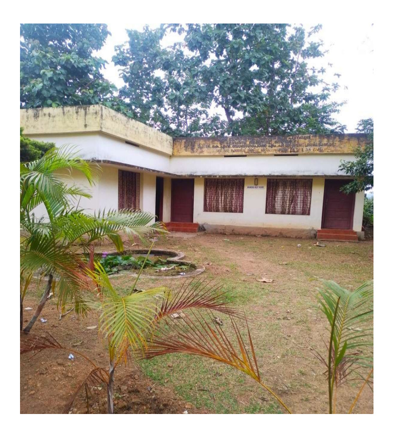
Women's Amenity Centre