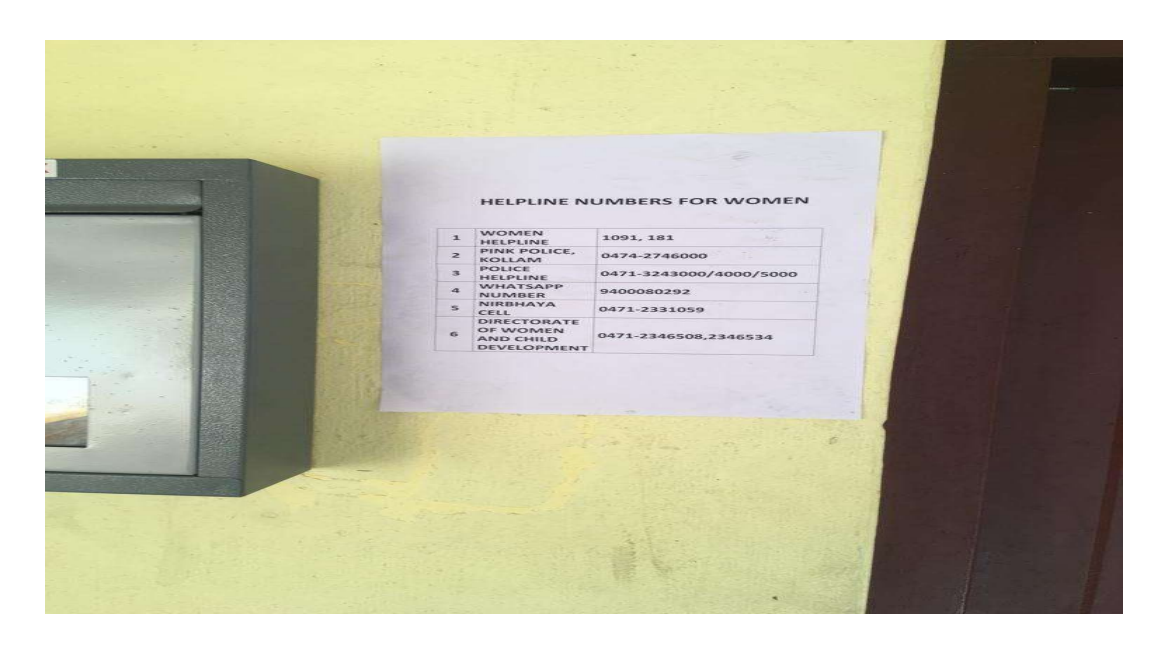
Women Helpline numbers