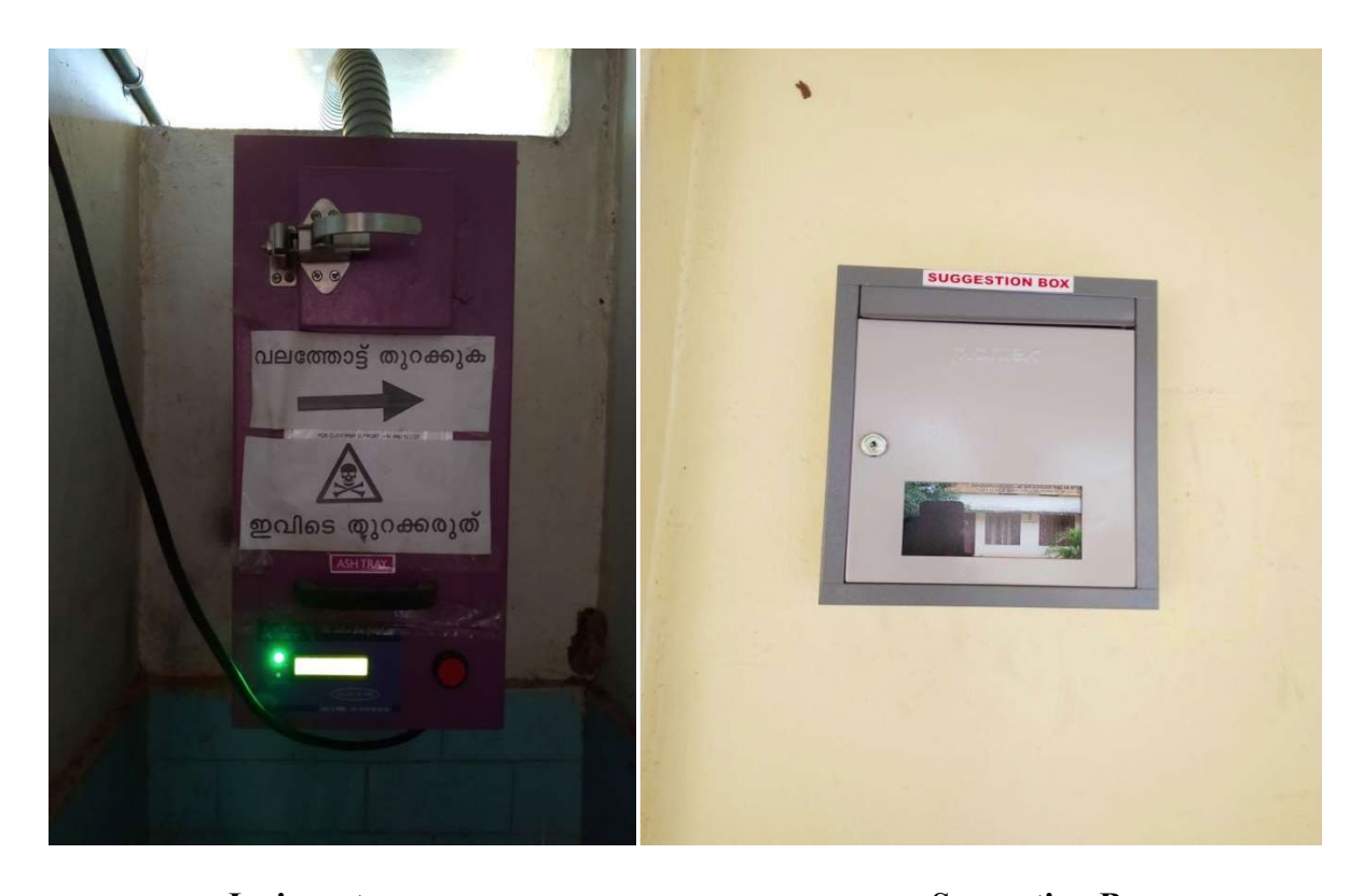
Incinerator Suggestion Box