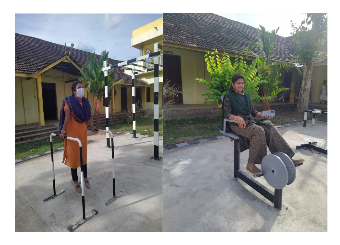
Open Gymnasium facility at college