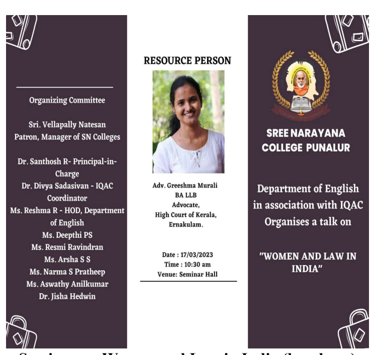
Seminar on Women and Law in India (brochure)