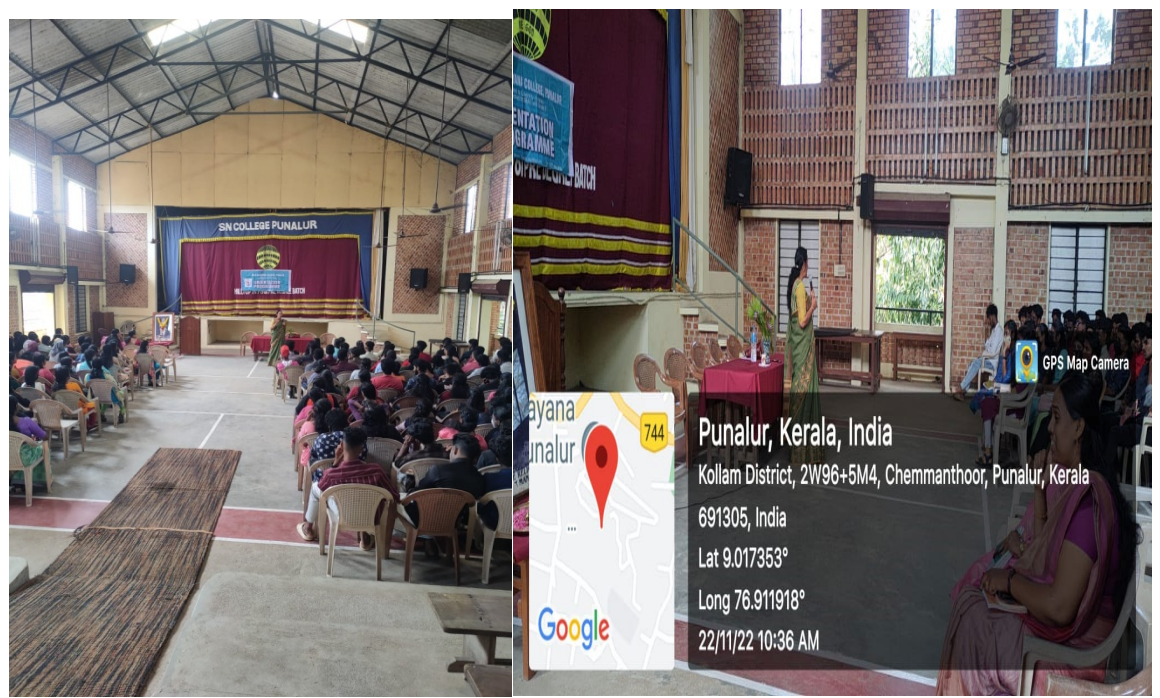
Orientation Programme for I year students