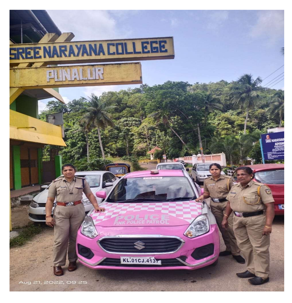
Pink Police Patrol